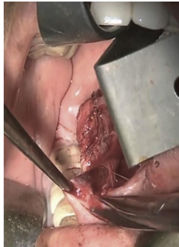
Fig (3): Submandibular Duct Dissection, distal to proximal approach.

of muscle border. The last step brings the swelling more toward operative field. Meticulous bit by bit dissection around the posterior pole of the gland where we suspect to deal with facial vessels. Bipolar diathermy was the main hemostatic instrument, sometimes required ligation. Further blunt dissection with judicious bipolar cauterization to completely extract the gland. Inspection for hemostasis and then wound irrigation. Hypoglossal nerve appears deep in the wound bed after gland removal. Closure of mucosa with loose stitches. External (extraoral) compression packs over the submandibular area.