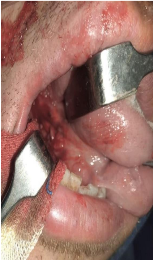
Fig (2): Starting the Mucosal Incision.

Handling of submandibular duct starts by mobilizing its orifice and then distal to proximal dissection (Fig.3). Then uncrossing the duct from lingual nerve (Fig.4) to put the duct laterally while the nerve is maintained medially toward the tongue to avoid undue stretching during the following steps. Further dissection of the lingual nerve from its ganglion was done to make it free.