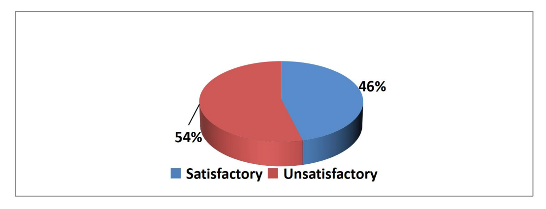
Figure (1): Distribution of the studied nurses according to their total knowledge about neurological disorders (n = 50)

(**) Highly Statistical significant difference at p<0.01