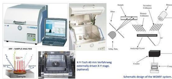
Fig. 2. High volume Sierra Impactor and Schematic design of WDXRF system.

The collected samples were analyzed using X-ray Fluorescence. In wavelength dispersive spectrometers, fluorescence X-ray photons are separated by diffraction on a single crystal before being detected. Although wavelength dispersive spectrometers are occasionally used to scan a wide range of wavelengths, producing a spectrum plot as in EDXRF, they are usually set up to make measurements only at the wavelength of the emission lines of the elements of interest, one element at a time. Collimation becomes even more important in WDXRF to focus the incident X-rays on the analyzing crystal at the appropriated Bragg angle. Eight elements (Cr, Fe, Ni, Zn, Sr, Ba, Mo, and Cu) were detected in the investigated samples of dust.