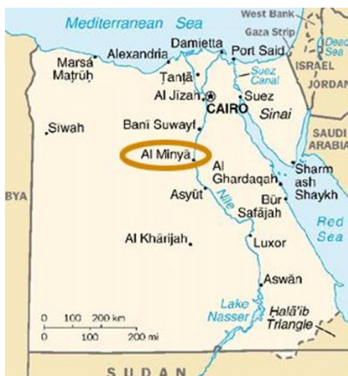
Fig. 1. El-mina governorate map.

The study includes both outdoor and indoor measurements in El-Minia Governorate, Egypt. Fig. 1 shows El-Minia Governorate map. Indoor measurements were performed in El-Minia University, 10 meter above the ground level (environmental radiation Lab) at physics department. The surface area of the Lab is about 50 m 2 . The sampling time is six hour. The university is located in the middle of El-Minia city in Upper Egypt [16,17].