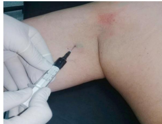
Fig. 2: Site of injection of dye at the ipsilateral arm's upper inner aspect.

We sterilize the skin at site of injection then we introduce the needle by an angle of 10 to 15 degrees (intra dermal) or 45 degrees (subcutaneous).