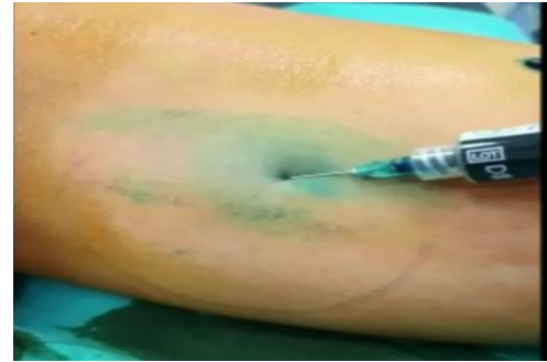
Fig. 1: Site of injection of dye at the ipsilateral arm's upper inner aspect

Site of injection: upper inner aspect of the ipsilateral arm intra dermal and subcutaneous (Figs. 1, 2).