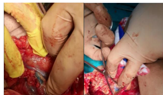
Fig. 3: Stained axillary LNs.