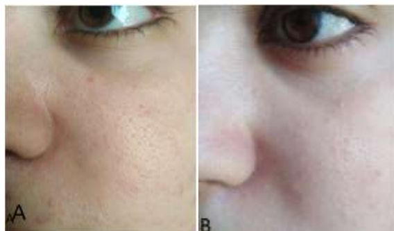
Fig. (1) (A) Before topical microbotox with microneedling (B) improvement after 1 month

End-of-treatment evaluations included immediate and long-term side effects such as discomfort, erythema, and edoema.