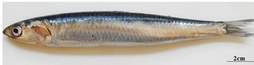
Fig. 1. Engraulis encrasicolus collected from Egyptian Mediterranean coast in Port Said

750 specimens of Engraulis encrasicolus (Fig. 1) were randomly sampled over a period 12 months (from March 2020 to February 2021) from the fish landing site in Port Said on the Mediterranean coast. Fish samples were dissected to study the monthly and annual variations in diet composition, feeding intensity and their relationship with the different length groups.