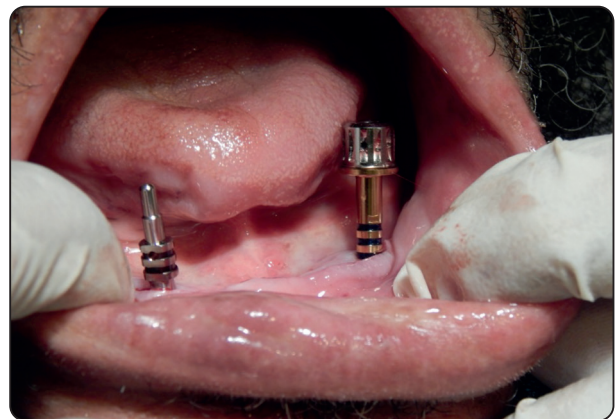
Fig. (1): Implant positions and directions verified with the paralleling tools

In each subject, two mandibular fixtures (Multisystem implant, Italy) were placed at the canine region following the surgical procedure ( fig. 1 ).