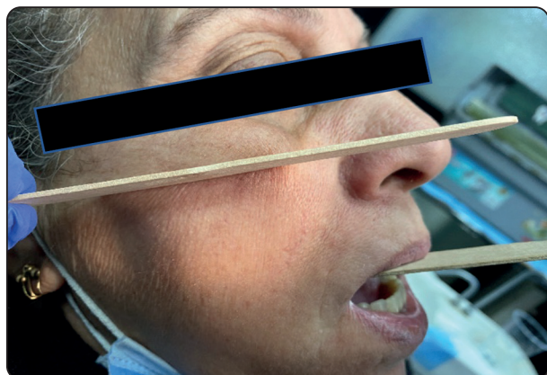
Fig. (2): posterior occlusal plane adjusted to be parallel to ala tragus line (camper's line) using tongue depressor

Dentures for both groups were finished, inserted and adjusted as the conventional methods.