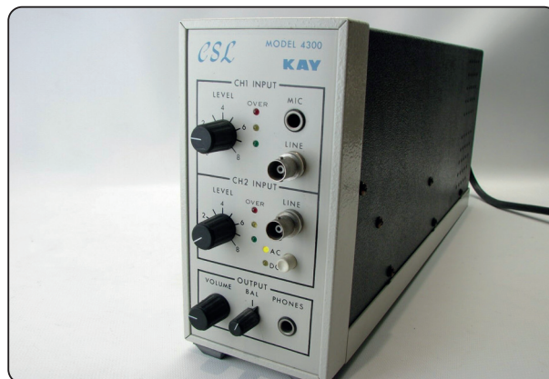
Fig. (3): Computerized speech lab device

Kay Elemetric Model 4300, USA) in phonetic unit ( fig.3 ), ENT Department, kasr El Einy hospital.