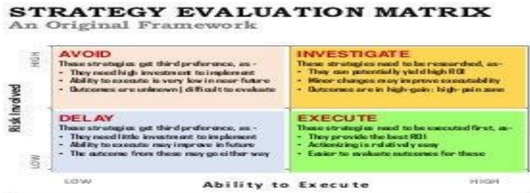
Figure :(4) strategy Evaluation Model .

Model of strategy implementation in MSME, whereas a leader is responsible for the strategy creation. (11)We are suggesting this model for strategy implementation as it could connect and interpret all processes.