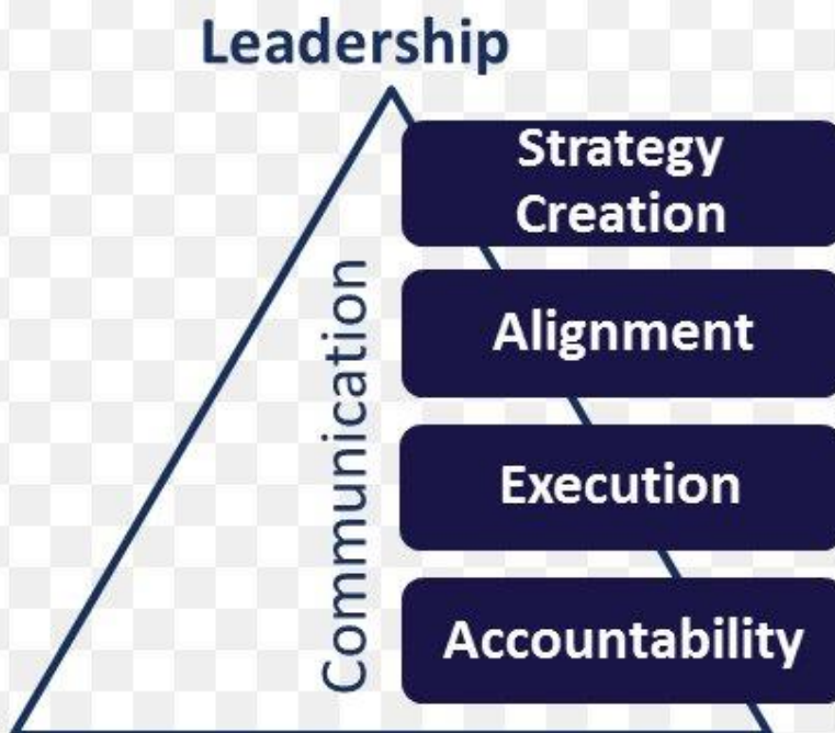
Figure :(3) Strategy implementation model .