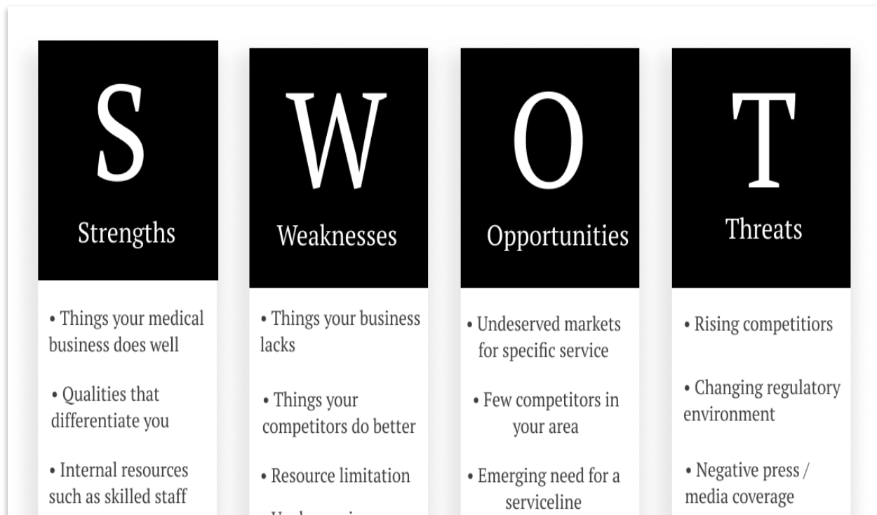
Figure:(1) SWOT Analysis.