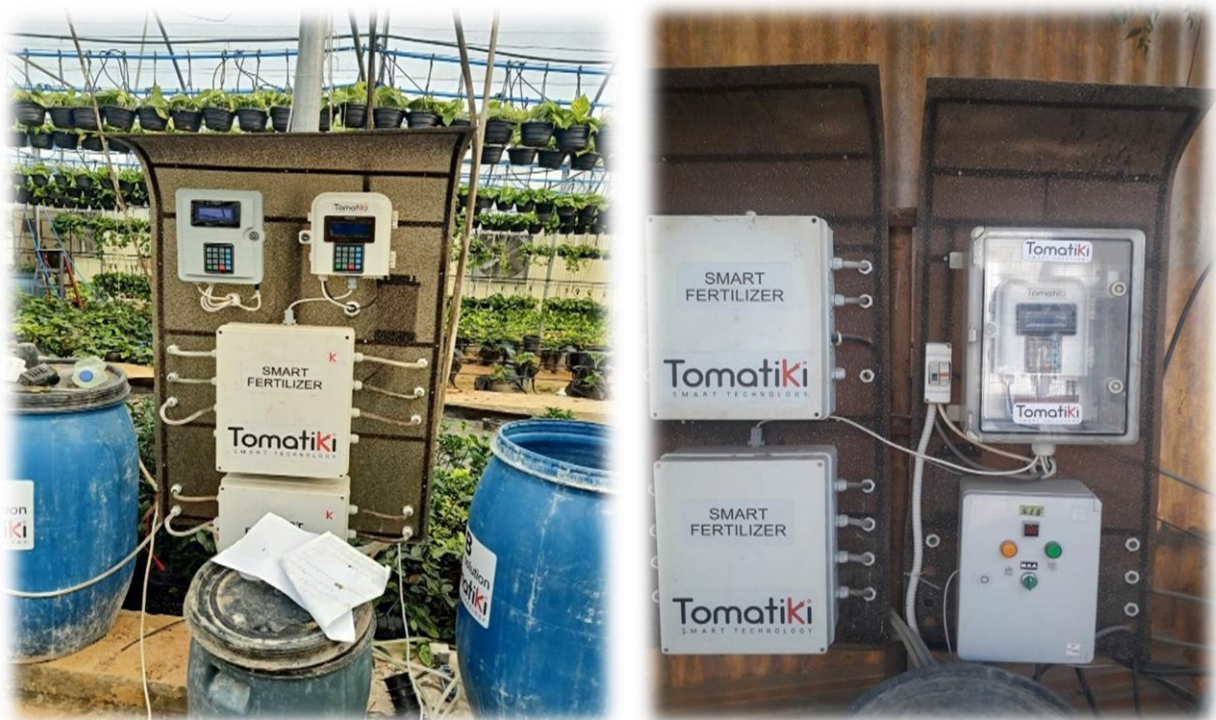
The unit of smart fertilizer in the fertigation system by using sensors