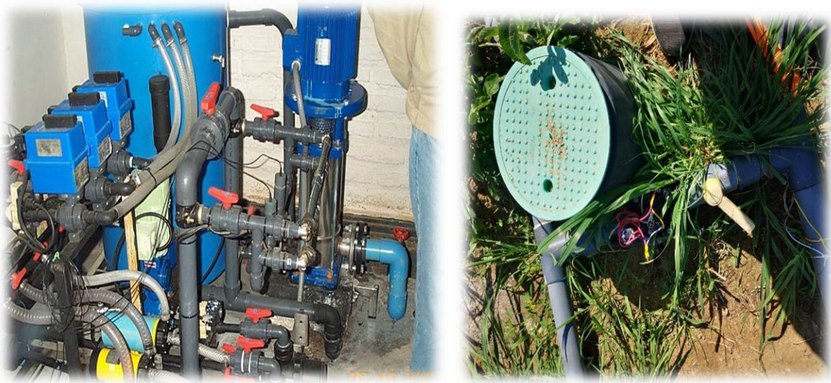
Automatic fertigation system by using three tanks A, B and C (left photo), and control valve. Netafim irrigation control valve in ground (right photo)