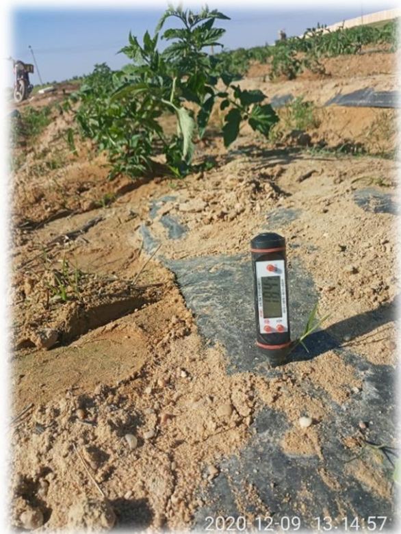
Measurement of the conductivity and temperature of soil which is used in smart irrigation scheduling (left photo), saving irrigation water by using plastic mulch which reduces evapotranspiration