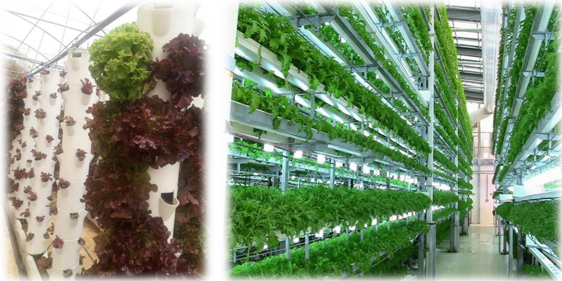
Photos for hydroponic systems including lettuce and leafy vegetables