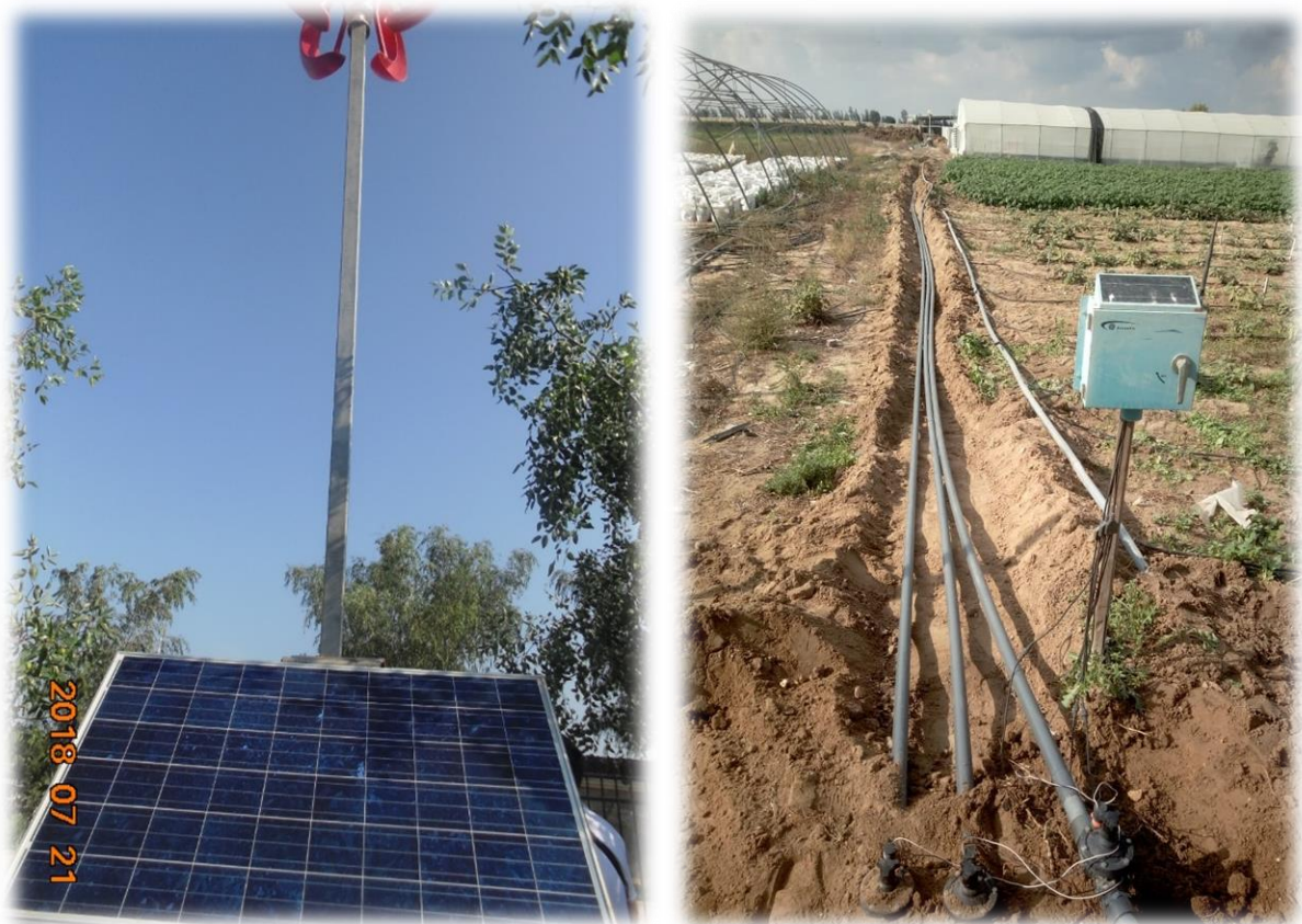
Meteorological weather station by solar energy, as one of the components that complements smart irrigation system (left) and part of the fertigation in the field (right photo)