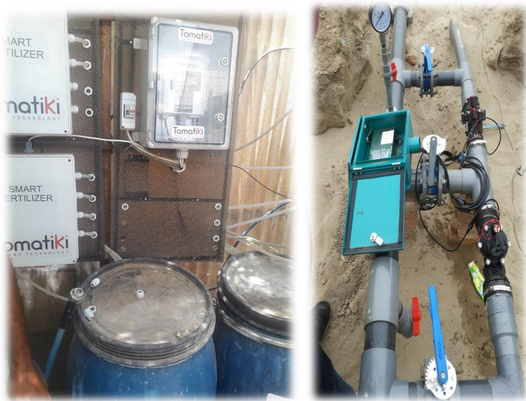
Fertilizer tanks and their control units (left photo), control board, check valves, solenoid valves and pressure gauge for smart fertigation (right photo)