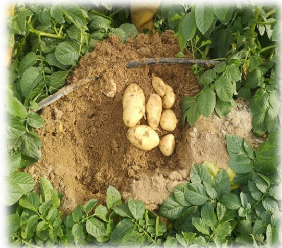
Smart irrigation and fertilizer in a field cultivated with potato crop using some sensors