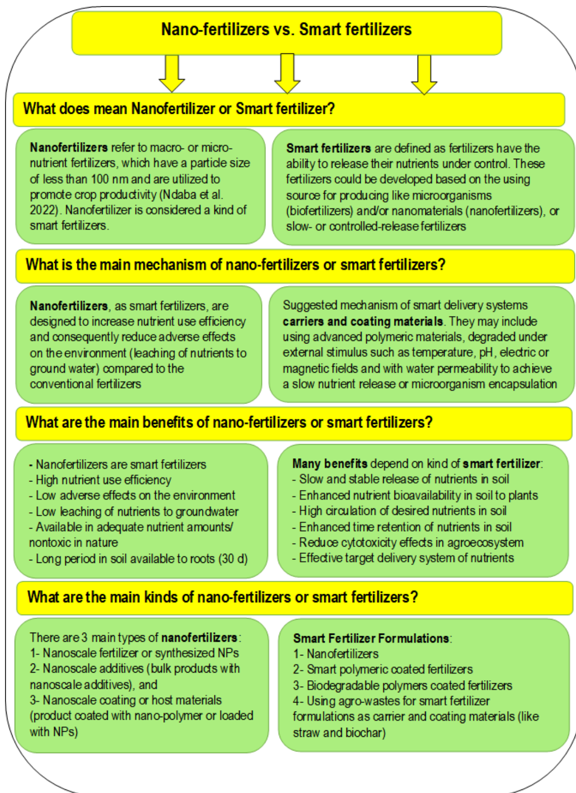
Fig. 2. A general comparison between smart fertilizer and nanofertilizer.