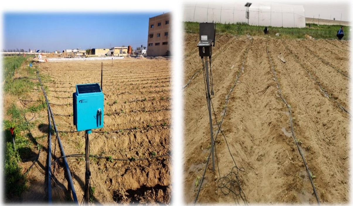
Motoring automatic drip irrigation system for large scale powered by solar energy (left photo), motoring station of soil moisture content and soil temperature at different depth by sensors at plant seedling stage