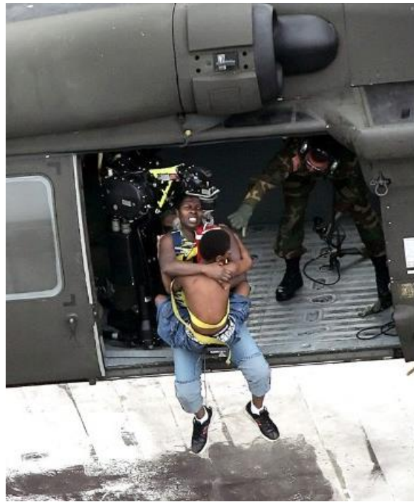
Figure 7: The Use of Helicopters during Evacuation