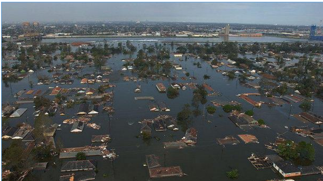
Figure 2: New Orleans Flooding after the Levees Failure