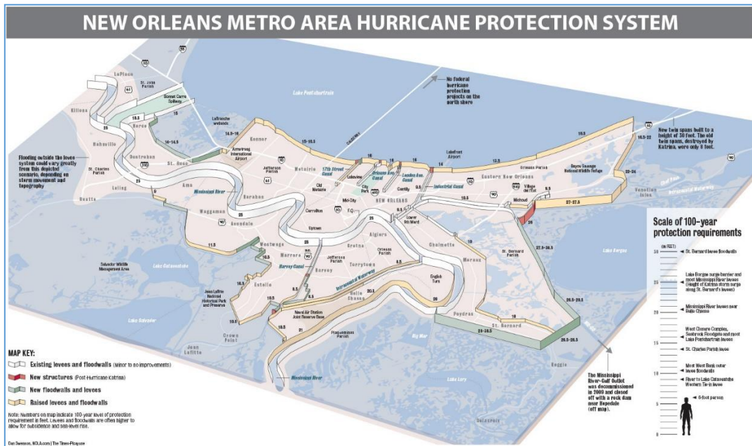
Figure 1: New Orleans Hurricane Protection System