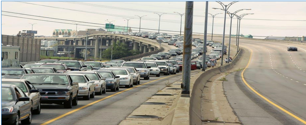
Figure 6: Evacuation Plans during Katrina

failure during hurricane Rita where it heeded to the warning and had no effective evacuation plan for the public. High-occupancy-vehicle lanes and inbound lanes on highways went unused as the officials waited until the last minute to open them. The result was that a significant percentage of New Orleans residents were stuck in traffic in their personal vehicles and could not move due to congestion (Litman, 2006). It is evident that the evacuation plans by the New Orleans government are not effective for saving the residents during hazardous events. The existing plans lack flexibility and resilience that would help the high-risk areas to mitigate and avert the loss of lives.