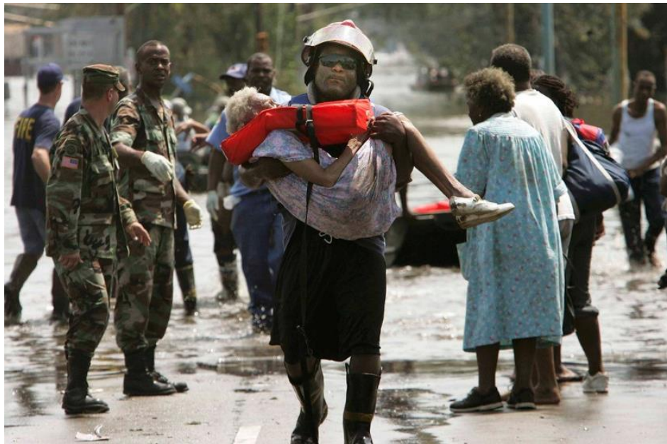
Figure 5: An Elderly Woman being saved after getting trapped in Flood Water