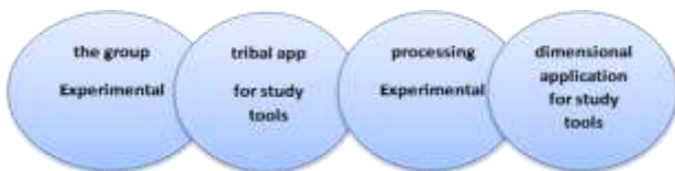
Figure (1) Experimental design of the study

The current research relied on the quasi-experimental approach, which depends on one group with a pre and post measurement of the research tools. The pre-test was applied to the sample children to determine their average scores on awareness of the national heritage and some values of citizenship before applying the program to them, and then applying the post-test after applying the program. After that, the comparison was applied between the average scores of the sample children to know the effect of the independent variable (the activities program) on the dependent variable (the development of awareness of the national heritage and some values of citizenship among the kindergarten child. The following figure shows the experimental design of Search.