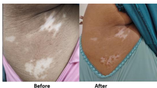
Fig 4: A 28-year-old female with axillary vitiligo before and after treatment showing improvement in patch A after 3 months of treatment. (Lower one 50 %) and patch B (upperone25%) (Patch B using (Intralesional Triamcinolone Acetonide).