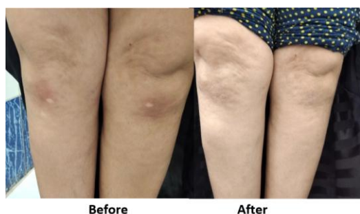
Fig 3: A 40-year-old female with knee vitiligo. Before and after treatment showing improvement in patch A (RT one100 %) and in patch B (LT one100 %) after 3 months of treatment. patch A using (intralesional methotrexate). (Patch B using (Intralesional Triamcinolone Acetonide).