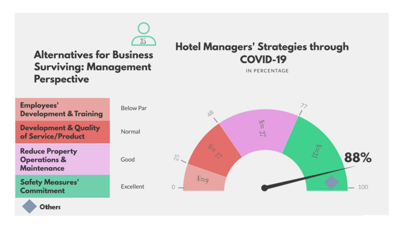
Figure (2): Hotel managers' survival strategies during the COVID-19 pandemic

Furthermore, as a result of the COVID-19 pandemic, it is critical to supply fresh information that may inform staff on how to adapt their operations in response to newly growing client desires and demands (Gursoy & Chi, 2020). In this context, 25% of managers underlined the importance of training personnel to adjust to the new work environment and changing consumer requirements and expectations imposed by the pandemic. In the same line, 77% of the participants reduced property operations and maintenance throughout slack periods of operations.