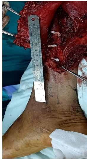
Fig 1: Correlation between pre operative CT angiography findings and intra operative clinical findings of the distal soleus muscle perforator with exact location.