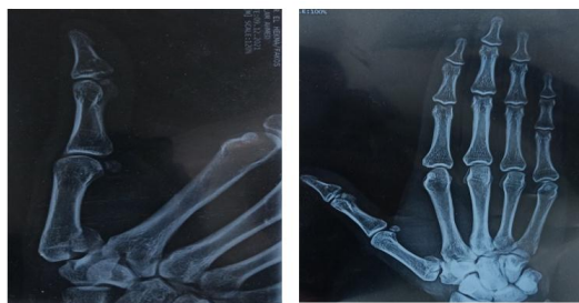
Fig 2: Plain X ray for Bennett's fracture Preoperative X-ray.

30 years old male with history of fall on the ground sustained left Bennett's fracture according to his plain x-ray (figure 2)