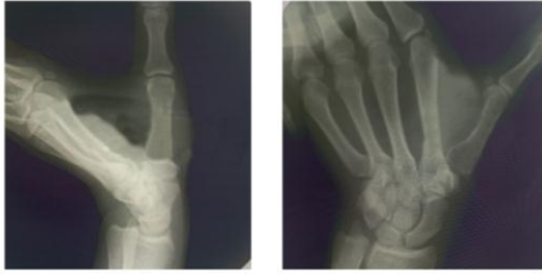
Fig 4: Plain X ray for Bennett fracture postoperative X-ray 3months.