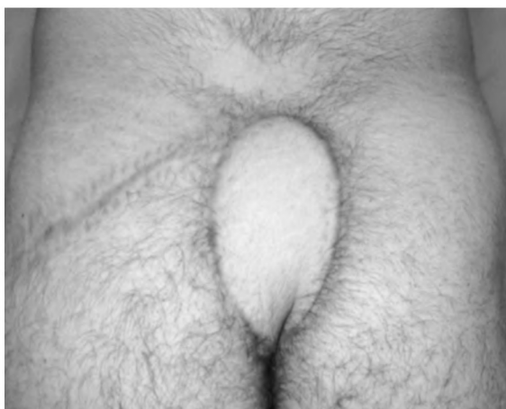
Fig. (3): Post six months follow-up of a case of group (A).