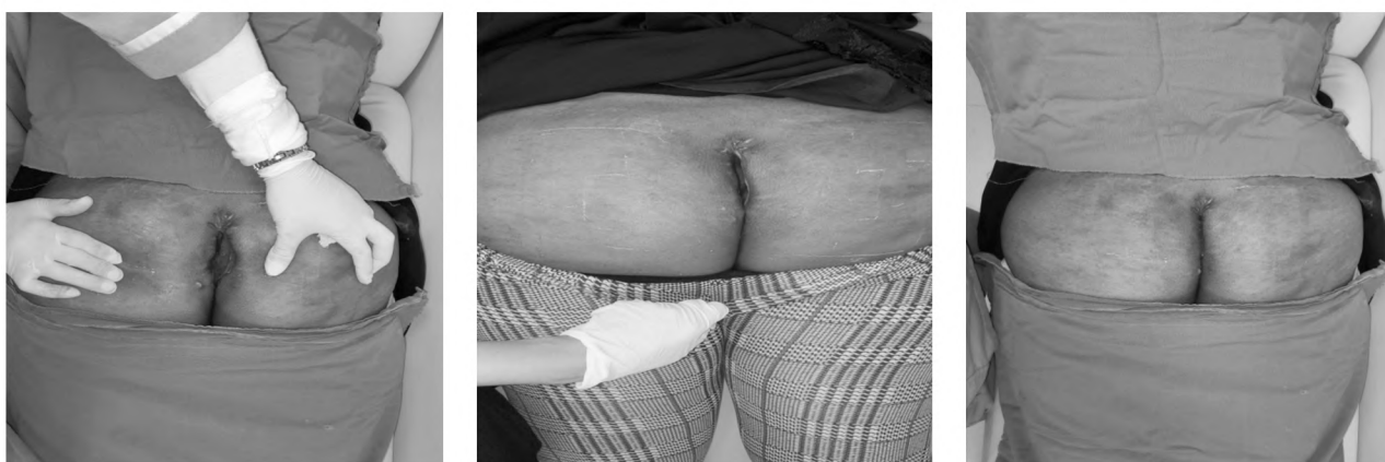
Fig. (4): Follow-up of a case of group (B) for six months.