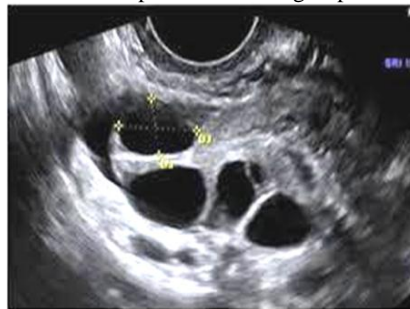
Fig. 1: U/S of a PCOS' patient showing multiple cysts in the ovary of the affected woman.