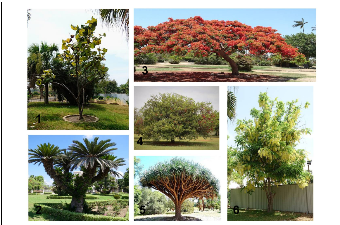
Fig. 6. Coccoloba pubescens L. (1), Cycas revoluta Thunb. (2), Delonix regia (Bojer ex Hook.) Raf. (3), Schotia brachypetala Sond. (4), Dracaena draco L. (5), Cassia fistula L. (6).