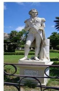
(E) Admiral Nelson