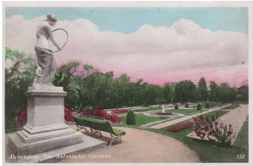
(A) Venus Statue