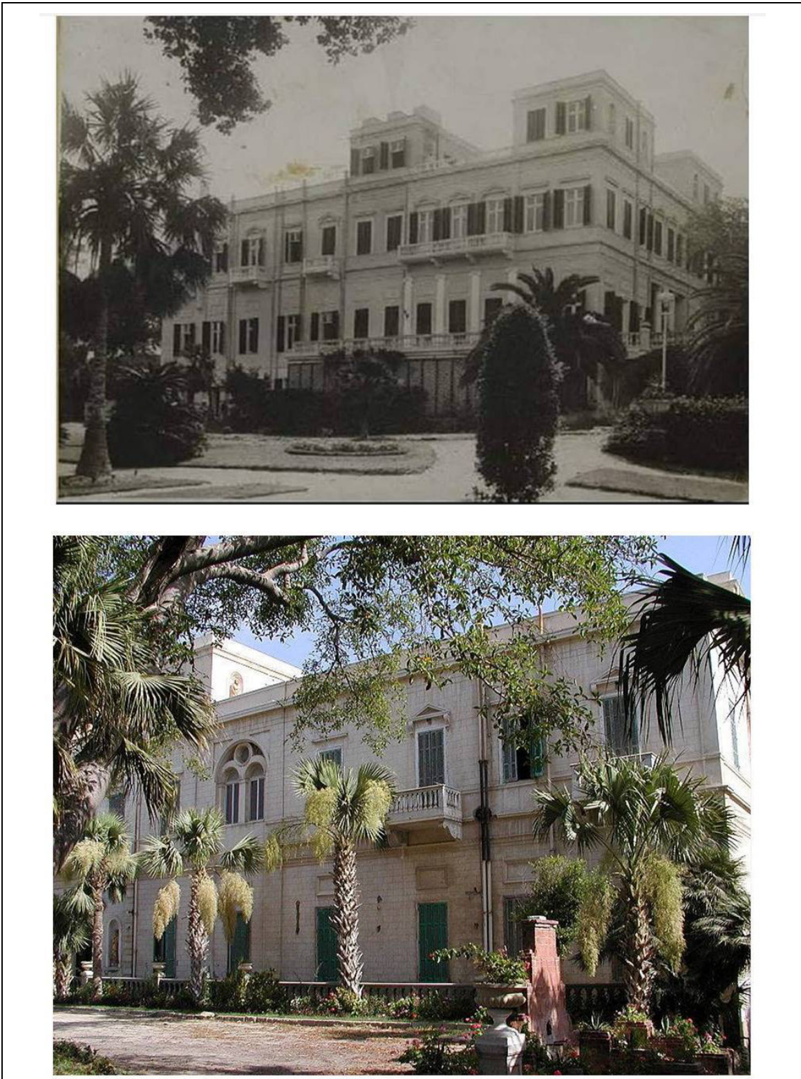
Fig. 2. A photograph showing Antoniadis palace inside Antoniadis garden.