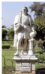
(D) Christopher Columbus