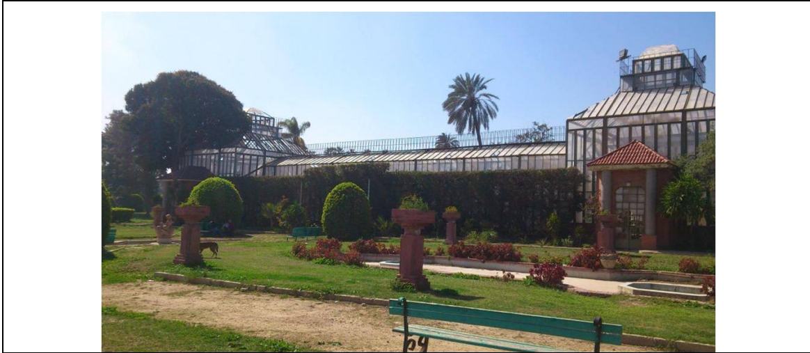
Fig. 3. A photograph showing the royal greenhouse of Antoniadis garden.

sun rays in the morning towards the southern windows of the palace. There are also statues representing the four seasons, in addition to lions made of alabaster. It also includes rare statues of many world historical figures, including (Christopher Columbus, Admiral Nelson, Magellan, Vasco di Gama) (Youssef, 2009 and Abd El-Rahman 2017), (Fig., 4).