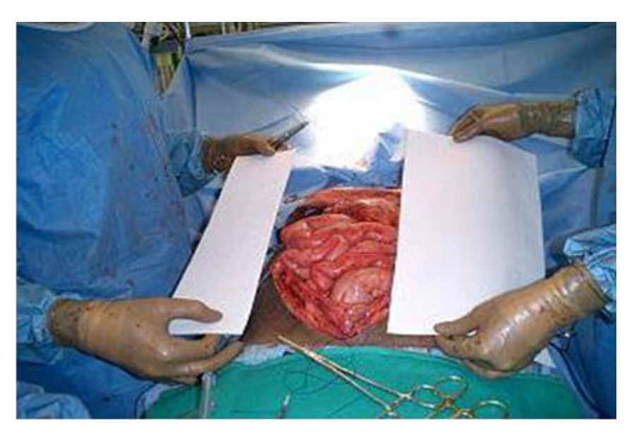
Figure (1): Wittmann patch sheets before applying to the wound ( Coleman, 2015 ).