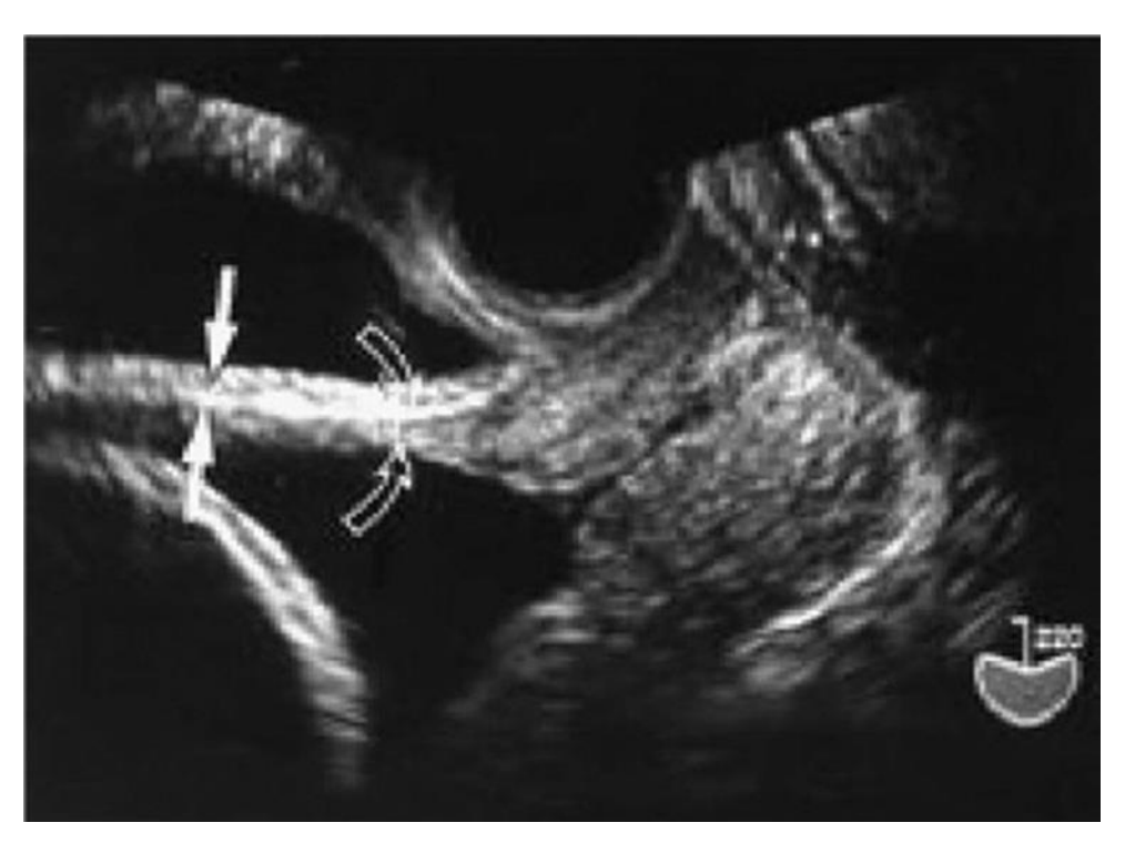
Figure (2): LUS and bladder full. Open arrow indicated the uterine wall and solid arrow indicated the bladder wall, LUS, lower uterine segment; TVS, and transvaginal ultrasound.

Ethical Consideration: Study protocol had been submitted for approval by Institution Research Board (IRB) of Faculty of Medicine Al-Azhar University. Informed verbal consent had been obtained from each participant sharing in the study. Confidentiality and personal privacy had been respected in all levels of the study.