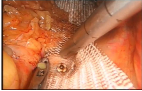
Fig. 4 Tacking mesh to sacral promontory using tacker