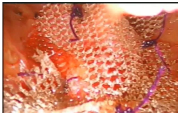
Fig. 3 suturing the distal end of mesh to anterior wall of rectum by interrupted suture