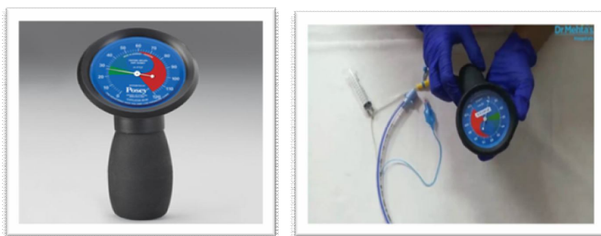
Figure 4. Endotracheal cuff pressure manometer Adopted from “Endotracheal tube cuff pressure: An overlooked risk” by Almetualli, R., Fallatah, Alghamdi (2021). Anaesth. Pain Intensive Care ; 25(1):88-97 DOI: 10.35975/apic.v25i1.1445.

inflated ETT cuff results in bronchial aspiration of secretion raising the risk of ventilator-associated pneumonia (Asfour & Ayoub, 2016; Abubaker et al., 2019). Thus, to decrease mortality and morbidity, and improve the delivery of health care services; critical care providers should be trained and supervised during ETT cuff pressure monitoring using a manometer, and institution policies should be available to ensure safe, quality care (Abubaker et al., 2019).