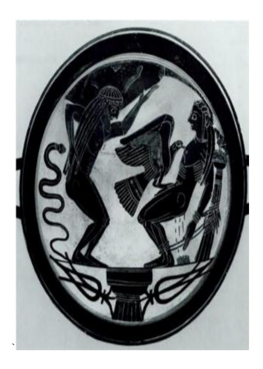
Pl. (1) The Punishment of Atlas and Prometheus, Laconian cup by the Arkselias painter, c. 550 BC, The Vatican, 16592.

After (Grifithes, (trans), Schefold, 1993) pl. 56