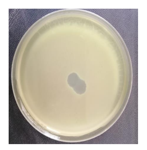
Fig. (1): Petri plate seeded with B. megaterium and spotted with a drop of the phage lysate.