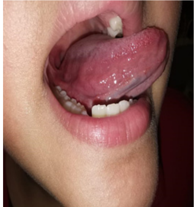
Fig.1-B: Outcome six months postoperatively.