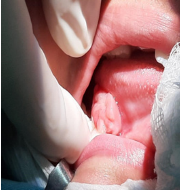
Fig. 1-A: Preoperative view of the mass.

Trauma to the tongue may be the initiating factor in this case, as the patient developed the mass after dental procedure.