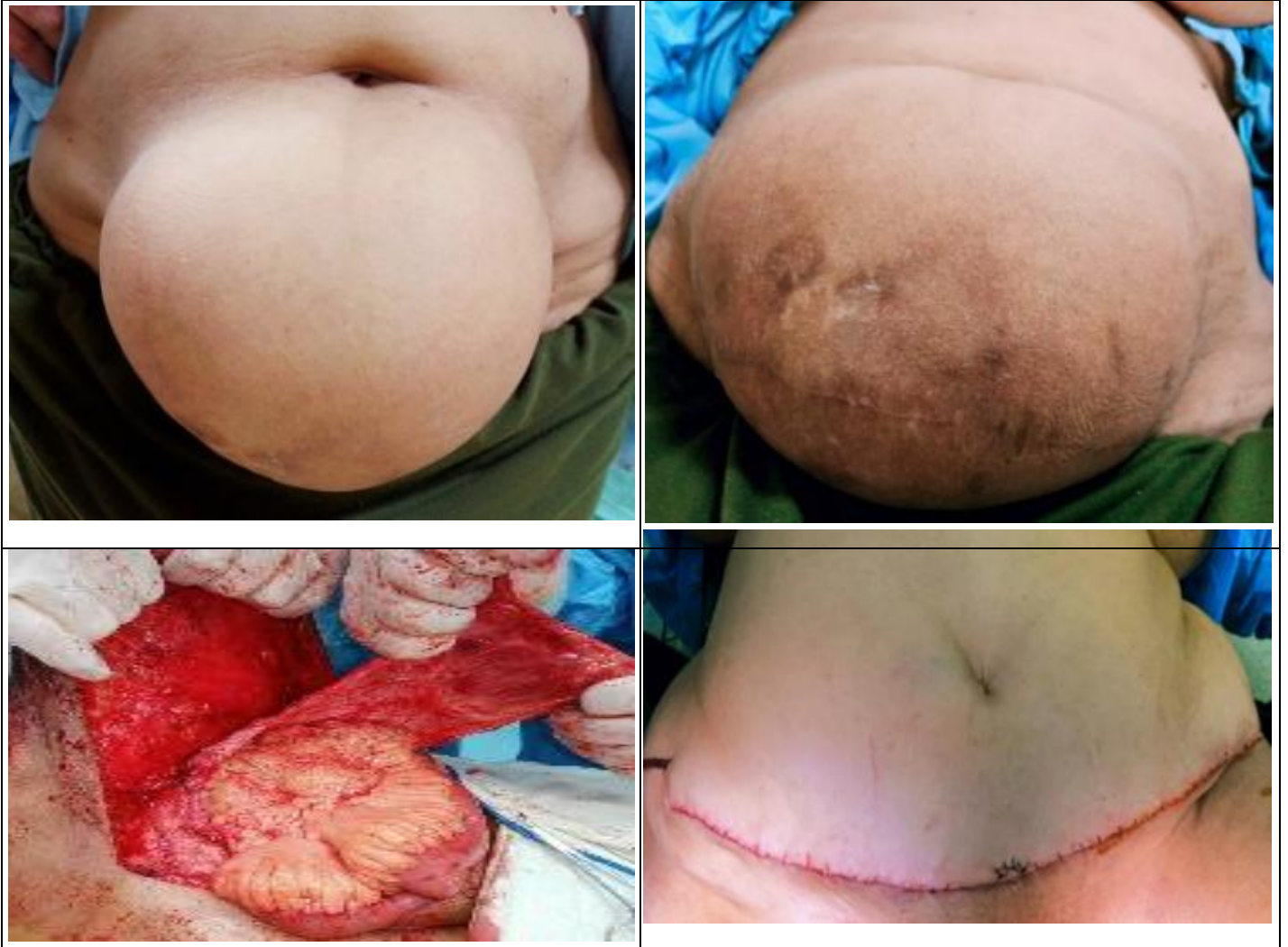
Figure (4): Huge incisional hernia with pendulous abdomen post pfannenstiel incision, operated by hernio-abdominoplasty with creation of new umbilicus.