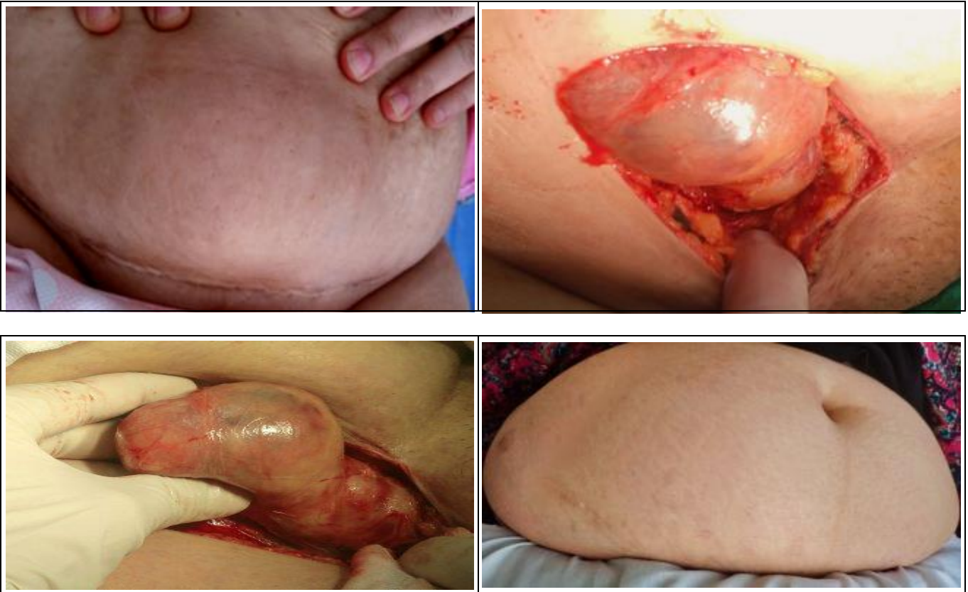
Figure (1): Hernioplasty for incisional hernia post pfannenstiel incision, in female with pendulous abdomen.