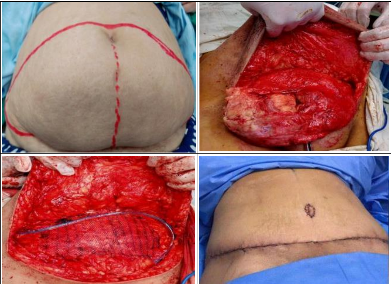
Figure (2): Hernio-abdominoplasty with preserving belly button for huge incisional hernia post lower midline laparotomy in female with pendulous abdomen.