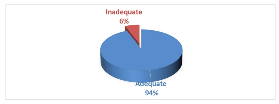
Figure (2): Total nursing teachers performance among nursing teachers (n=50).

Table (3): Relation between nursing teachers' total perception regarding organizational trust and their performance.