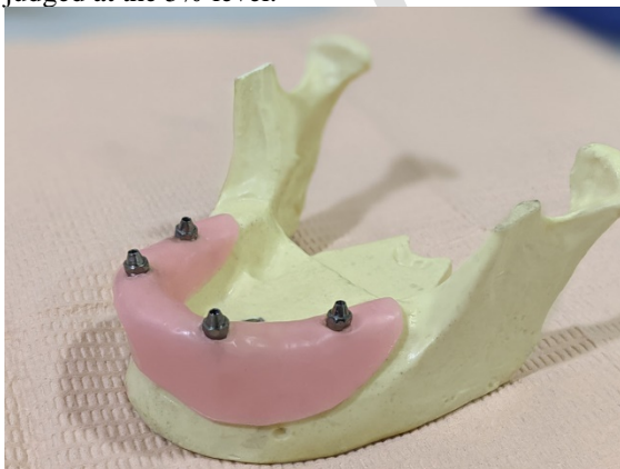
Figure 1: Four one-piece implants with multi-unit abutment after placement in the model using surgical guide.

Mann Whitney test was used to compare between two groups for not normally distributed quantitative results. Significance of the presented results was judged at the 5% level.