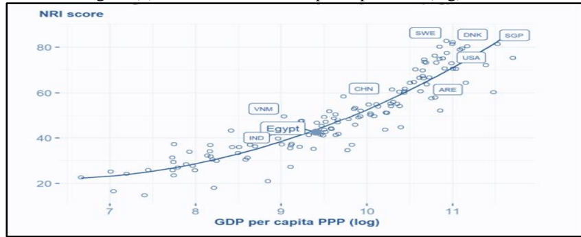
Figure (4): NRI score and GDP per capita PPP (log)2020