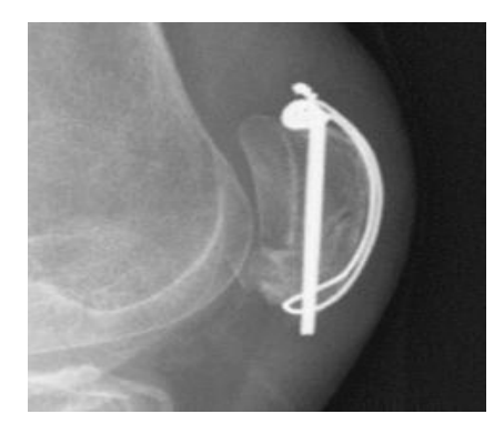
Fig (3): 3 months follow up x-rays showing union of patella fixed by modified tension band wiring.