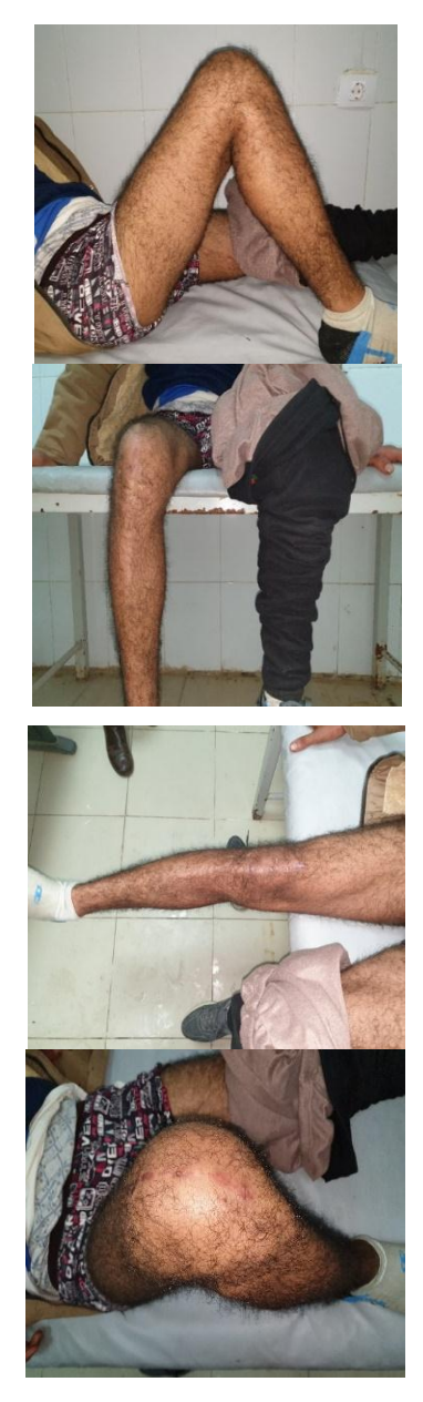
Fig. (4): Clinical pictures showing range of motion at 3 months follow up.