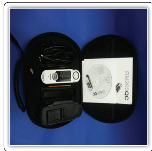
FIG (2) Laboratory spectrophotometer X-rite

Translucency of the specimens were measured using a Reflective spectrophotometer for all eighty samples (Model RM200QC, X-Rite, Neu-Isenburg, Germany), (fig.2). The measurements were performed at the center of each specimen over a white (CIE L*, a* and b*) and black backing (CIE L*, a* and b*) relative to the CIE standard illuminant D65.