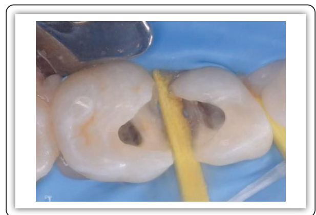
FIG (1) Gaining access and cavity preparation.

The pulpotomy procedures was performed as follows: administration of local anesthesia, followed by isolation of the operative side with rubber dam. Then, all caries was removed with a high-speed handpiece and carbide bur. After that, access cavity preparation by a sterile fissure bur. The coronal pulp was amputated entirely with sharp spoon excavator. Then, the pulp chamber was rinsed with water and the hemorrhage was stopped with cotton pellets moistened with normal saline (17) as showing in figure (1).