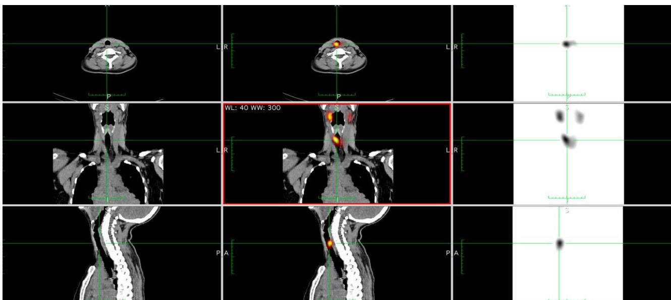
Fig.(1): Following total thyroidectomy, thyroid scan with SPECT/CT images demonstrating radioactive isotope uptake at location of thyroid implant