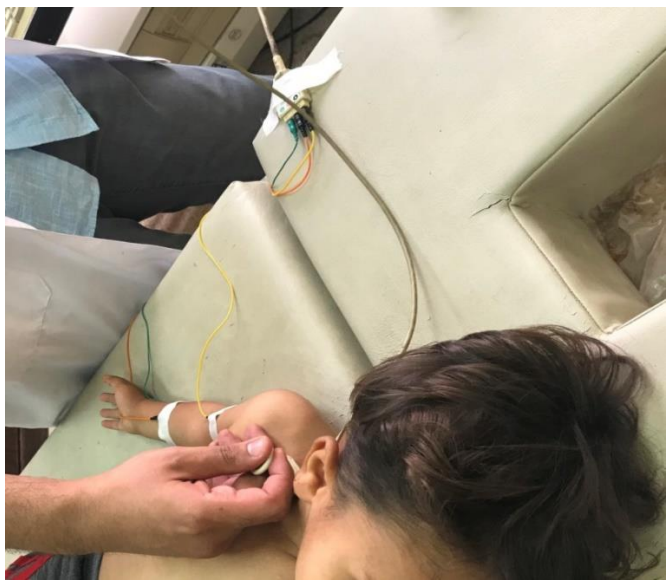
Fig. (1): application of electroneurography.

Then on the affected side, the ground electrode was placed below the lateral 1/3 of the clavicle. The stimulation current intensity was increased stepwise until there was no further increase in the amplitude of the dysphasic myogenic cap.