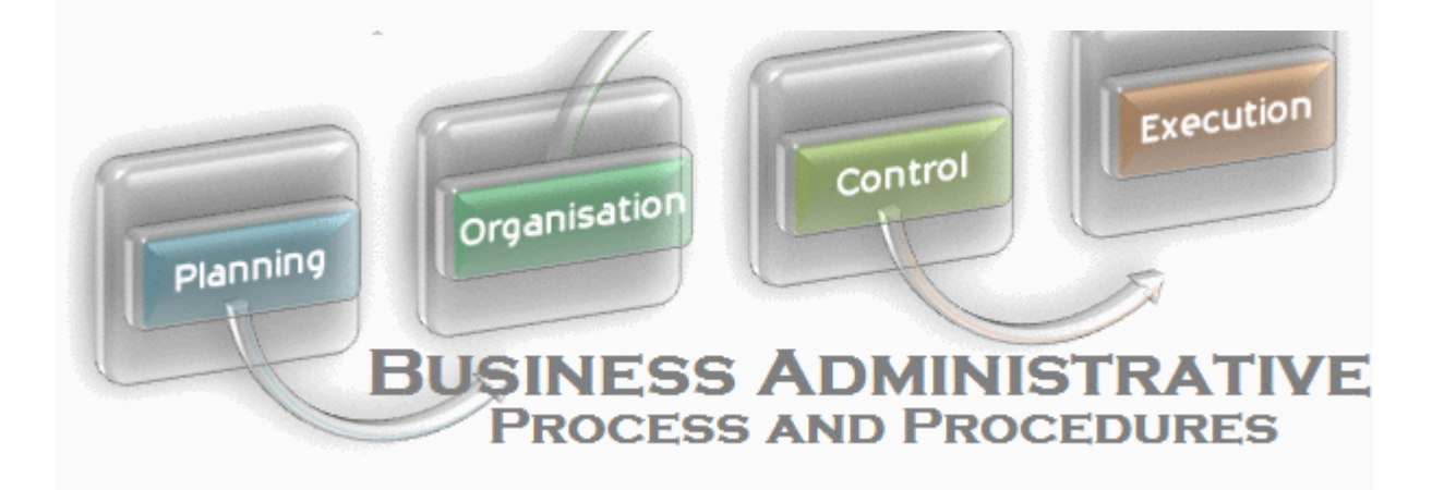
Figure 3: Business Admin process.

Let us step by step discuss the important functions and parts of business administrative processes and procedures in detail: