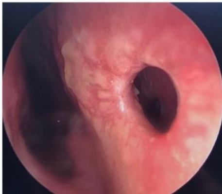
Fig.3: septal perforation.

group was statistically insignificant. The results of this study agree with the results of Kaushik et al. 11 regarding persistent posterior and spur deviations who reported statistically insignificant differences between both groups. In our study, the postoperative improvement of nasal manifestations after 3 months such as Nasal obstruction, Headache, post nasal discharge, epistaxis, smell disorders and ear complaint shows no statistically differences between both groups. The results of this study agree with the results of Gupta et al. 16 However The chief complaint of the patients in our study was nasal obstruction reported by all patients in both groups. In our study only 2 (6.7%) patients had nasal obstruction in group A and 4 (13.3%) patients in group B. There is no statistically difference between both groups (p value 0.389). In a similar study done by Sathyaki et al. 2 conducted on 50 patients with nasal obstruction, 46 of the 50 patients were relieved of nasal obstruction of which 22 of the 25 patients belonged to conventional and 24 of the 25 patients belonged to endoscopic septoplasty group. Use of an endoscope during the performance of the conventional septoplasty to assess the result of the procedure and correction of the defect not visualized by the naked eye is advantageous especially in relief of symptoms of nasal obstruction and headache. 17