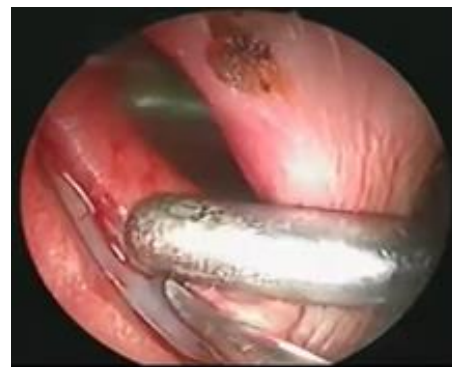
Fig.2: Flap elevation on the left side.