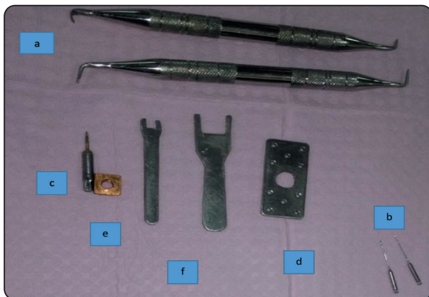
Fig. (1): Photograph showing components of the ATM extractor system: a: Modified periostomes, b: Special Drills, c: Modified ready-made post, d: Metal tray with a hole corresponding the post, e: The Nut, f: Special Wrench driver.

Teeth to be extracted in the same patient were divided randomly into two groups: In the study group, patients received local anesthesia in regular fashion, then periodontal ligaments around the roots were cut using modified periostomes (Fig. 1a). Root canals were prepared with special drills (Fig. 1b) so that certain modified ready-made post (Fig. 1c) is inserted stably in the canal to extract the root. A putty rubber base cushion was applied on the adjacent teeth followed by seating a metal tray with a hole corresponding the post (Fig. 1d). After the rubber base sets, the nut (Fig. 1e) was applied on the post using special wrench driver (Fig. 1f) till the root comes out (Fig.2).