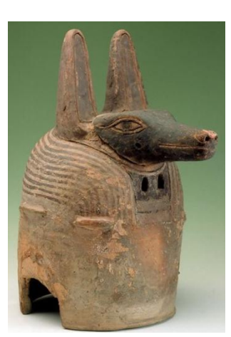
Figure 2: A Ptolemaic statuette of Anubis in the Metropolitan Museum of New York (Arnold 1995, no. 8)

Figure 3: A canine terracotta mask of Anubis in the collection of the Roemer-Pelizaeus, Hildesheim, Germany (Wolinski 1987, 28)