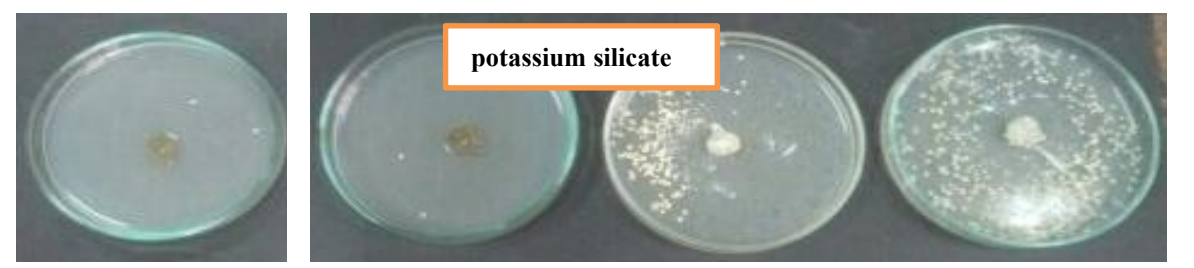
Fig. 3. Growth of P.italicum on PDA amended with varying concentration potassium silicate salt; Control = unamended medium incubation at 25°C in 9-cm-diameter Petri dishes.

3.4.1.2. The inhibitory efficacy of different concentrations of some organic acids on the mycelial growth of P. digitatum and P.italicum .