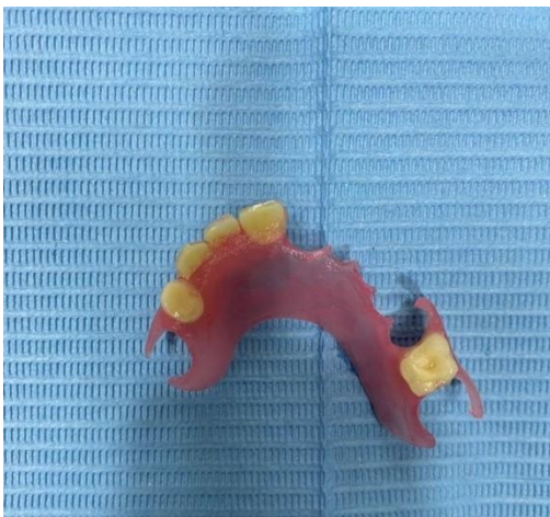
Figure 3: finished and polished flexible partial denture

used, an over-impression of teeth on the working cast of the initial acrylic partial denture was putty impression material, which was used to locate the exact position of the teeth on the second flexible partial denture. Try-in was done for trial dentures of both partial dentures and found satisfactory before processing the partial dentures. The initial acrylic partial denture using heat-cured acrylic resin was processed, while for the second flexible partial dentures, Valplast (dentiflex-roko, Poland) was used ( Figure 3 ).