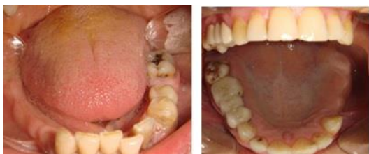
Figure 1: an intra-oral examination of the partially edentulous lower arch

Patients were diagnosed and examined on a dental chair. Intra-oral examination of the edentulous ridge was done to ensure it was well-formed and free from any anomalies ( Figure 1 ). Appropriate infection control was applied.