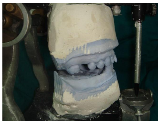
Figure 2: mounting upper and lower cast on articulator

arches was taken in a sterile well-fitting stock tray using irreversible hydrocolloid impression material (Cavex Holland B.V., P.O Box 852-2006 RW Harlem, Holland) and poured to obtain the diagnostic casts (Type III dental stone ) The cast was duplicated to produce two working casts for the acrylic and the flexible partial dentures to ensure the exact dimension for both partial dentures. self-cured acrylic resin (Peka tray Acrostone . England) special tray was constructed and a final impression was made using rubber base impression material (Gollene Speedex Dental Vertrieb G murrbt Konster. Germany), boxed and poured in dental stone. Occlusion blocks were constructed on the master cast. mount the upper cast on a semi-adjustable articulator (Whip Mix # 8500; Louisville, KY.U.S.A) the mandibular cast was mounted according to a centric relation record obtained from the patient using the check bite technique ( Figure 2 ).