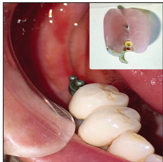
Figure (2): Try-in porcelain crowns-OT Unilateral attachment-assembly and final prosthesis from fitting surface.

In group II, this design provides crossing the midline for stabilization of the prosthesis through lingual bar major connector retained by a double Aker clasp at the dentulous side was done for cross arch stabilization as follow, second premolar was prepared to receive occluso - distal rest seat and occluso-mesial rest seat on first molar to accommodate double Aker's clasp, occluso-mesial rest seat on first premolar was prepared for the terminal end of lingual bar as indirect retainer, try-in the final porcelain crowns-attachment unite was done intraorally after selection of proper porcelain shade for each patient.