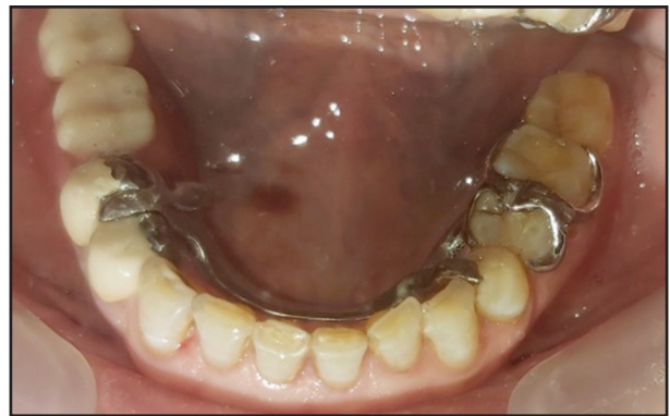
Figure (3): Final prosthesis of OT cap with metal framework.

and second molar are as follow, First line was drawn as upper highest reference point at the peak of crest bone mesial to the second premolar to the lower reference point at inferior border of mandible, second line at distal surface area, third line at first molar area making mesio-buccal cusp of upper first molar as reference point, mesio-buccal cusp of upper second molar as reference to the fourth line, third and fourth lines represent the free end saddle area under the denture base, All lines were parallel to each other and perpendicular to the inferior border of mandible. All data were collected and statistically analyzed. (Fig .4)