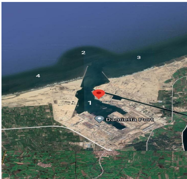
Fig. (1): Location map of Damietta fishing port and the surrounding environment parts of the Mediterranean Sea area where 1, 2, 3, and 4 are the sampling sites