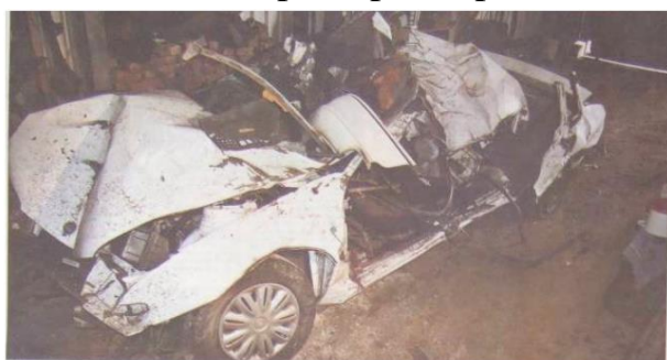
Fig. 3: A crashed car as adopted from (Economou, 2009, p. 118)

It is also worth mentioning that photos depicting places or objects (without any human participants) can inscribe and evoke affect in viewers just like photos depicting human participants. How can this be interpreted? Economou (2009) claims that a photo showing an object with visual features that imply human behavior and associated feelings can also evoke in viewers some affect with implied participants.