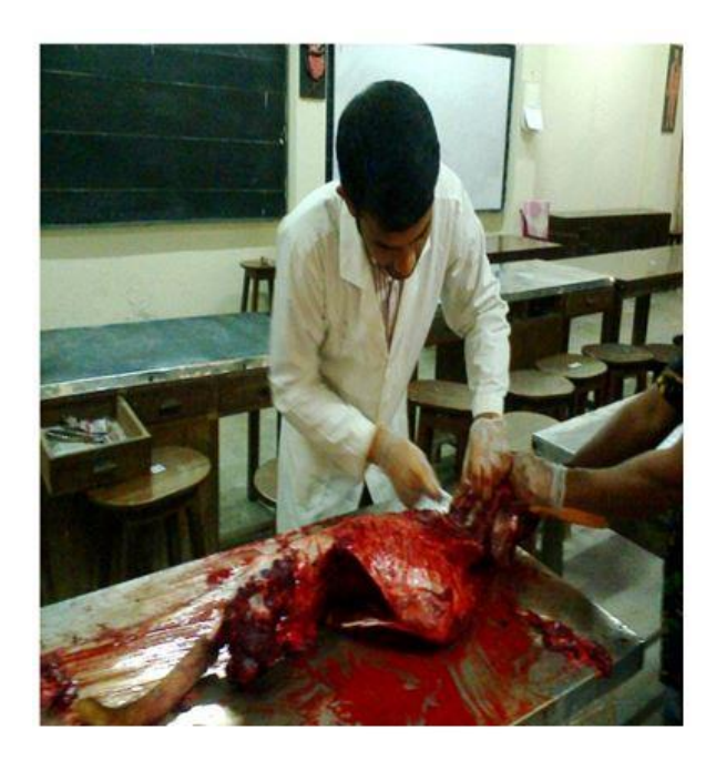
Fig.1: Skinning, Evisceration, and Separation of different body parts.

Separated the animal body into different parts: fore-limb, hindlimb, skull with vertebrae, ribs & sternum, and pelvic bone (Fig. 1). Fore-limb, hindlimb, and pelvic bone are packed in a nylon mesh with an identified marker to avoid mixing. A thin wire (1 mm) was driven through the vertebral column to the skull to keep the natural order of vertebrae from skull to tail. Ribs and sternum are tightly knotted serially by a copper wire (0.5 mm) in situ position of the skeleton and gently pulled away from the backbone.