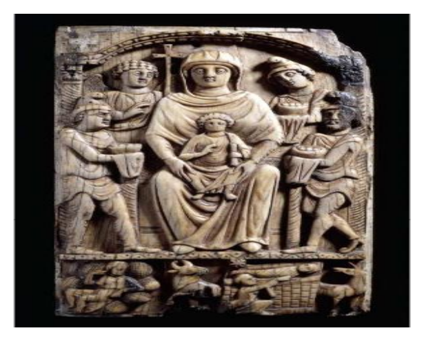
Fig. 14: Ivory plaque with Magi, after; Bergman R. P., "The Earliest Eleousa", 47.