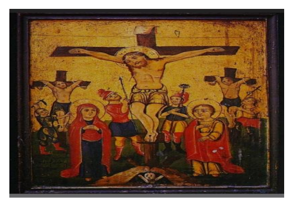
Fig.17: Icon of crucifixion, after; Attala N. S., Contic Icons. 61.

The icon of Crucifixion is preserved in the church of the Theodore the oriental in Old Cairo, dates back to the nineteenth century. It worthy to notice that the painter used the same Phrygian cap to identify the two Roman Soldiers to distinguish them from the rest of the people in the scene (Fig.17).<sup>33</sup>