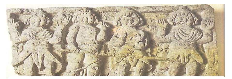
Fig. 6: Limestone relief of the Three Hebrews, after; Gawdat Gabra, Cairo, The Coptic Museum, 68.