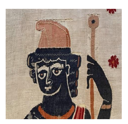
Fig. 8a: Detail of tapestry curtain, after; Strzygowski J., "Der Koptische Reiterheilige", 54.