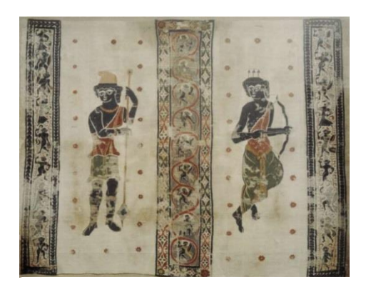
Fig. 8: Tapestry curtain, after; Strzygowski J., "Der Koptische Reiterheilige", 54.

A part of linen and wool curtain discovered in Akhmim, Upper Egypt. It is now on display at the British Museum. It is dated back to the fifth century AD. This curtain is richly colored and ornamented. The main figures represent a female figure to the right with green skirt represents goddess Artemis with bow and arrows; the male is depicted to the left represent god Actaeon god with his spear. He wears Phrygian cap in yellow color. The middle panel shows a dancing male figures within scrolls. Side panels shows dancing figures within vine tendrils (Figs. 8, 8a).<sup>24</sup>