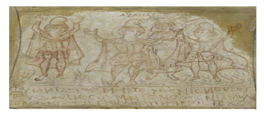
Fig. 5a: Detail of wall painting of Wadi Serga. After; Badawy A., Coptic Art and Archaeology, 324.