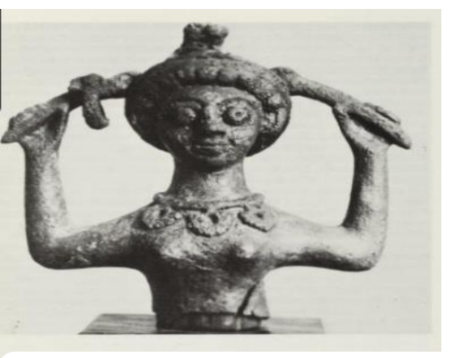
Fig. 12: Bronze Incense burner. After; Kalavrezou L., Byzantine Women, 201, fig.112.