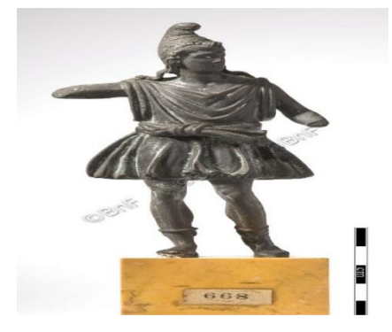
Fig. 3 : Statue of god Attis in Bibliothèque Nationale de France. After; Ernest Babelon E., Blanchet J., Catalogue des Bronzes , 287. Antiques

<sup>8</sup> Lynn E. Roller, Attis on Greek Votive Monuments; Greek God or Phrygian? Hesperia: The Journal of the American School of Classical Studies at Athens , Vol.63, no. 2 (April-June 1994), 259.