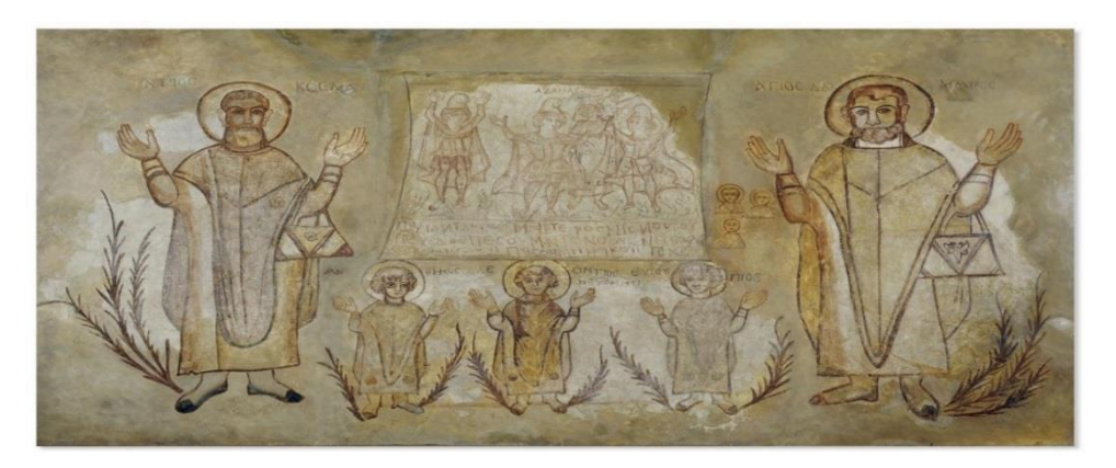
Fig. 5: wall painting of Wadi Serga. After; Badawy A., Coptic Art and Archaeology, 324.