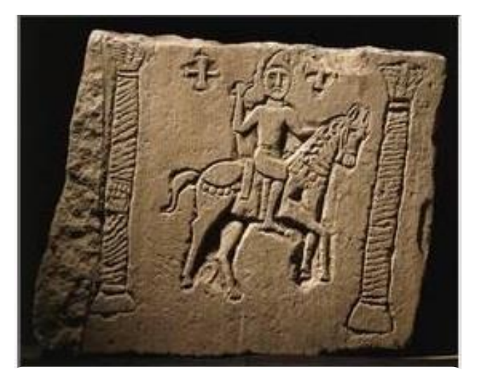
Fig. 7: Limestone stela of St. Theodore Al Mashraqy. After; Badawy , Coptic Art and Architecture , 194.

The stelae show St. Theodore the oriental. It is made out of limestone. It is preserved in Turin Museo Egizio museum in Italy. It's probably dates back to fourth century AD. It was discovered in Fayoum. It represents St. Theodore Al Mashriky as a soldier saint riding his horse. His head is adorned with the Phrygian cap, on both sides of his head there are two crosses with equal sizes (Fig.7).<sup>23</sup>