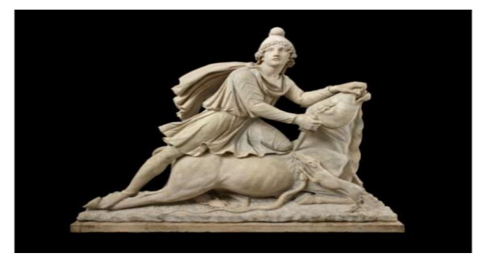
Fig. 4: God Mithra in British Museum, after; Smith A.H., A Catalogue of Greek Sculpture , 86.

Mithra preserved in British Museum. It dates to the second century AD. It was discovered in Rome city. He appeared slaying a bull. He wears eastern costume with a Phrygian cap (Fig.4).<sup>18</sup>