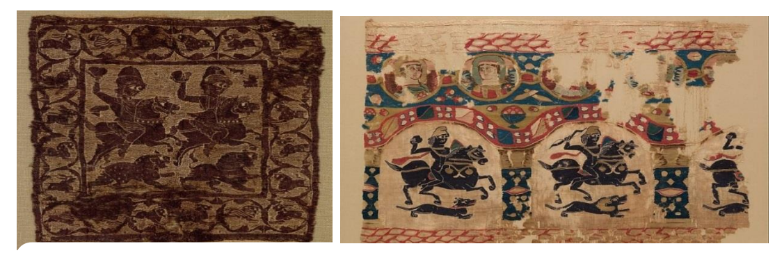
Fig. 9: Textile curtain, after; Riefstahl R.M., First National Silk Convention: Catalogue ,19.

Fig. 10: Linen and wool curtain. After; Annmarie S., Textiles of Late Antiquity , 22.