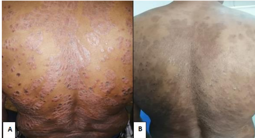
Fig.1. Male patient, 35 y old of 2 years duration showed marked improvement after 36 sessions.