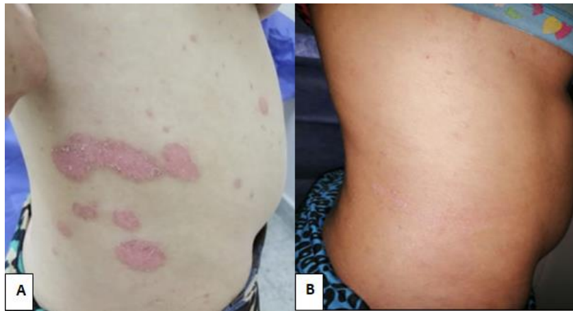
Fig.2. Female patient, 30 y old of 6 months duration showed a marked improvement after 24 sessions.