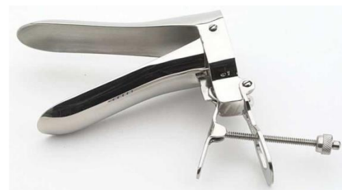
Fig. 1: Cusco Speculum

One day before to IUI, hydrotubation was performed. Using an empty bladder, the patient was positioned in the lithotomy posture, the cervix was opened with a Cusco speculum, and the portio was cleansed with a swab saturated with saline.