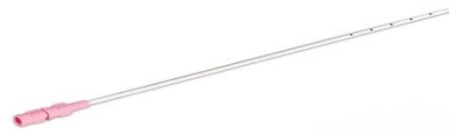
Fig. 2: Wallace Catheter

Posthydrotubation: Intrauterine insemination was accomplished utilizing an intrauterine catheter (Wallace or Cook IUI catheters) linked to a 2 ml syringe 24 hours after hCG treatment. After 2–4 days of sexual abstinence, sperm was collected via masturbation into a sterile container. For semen preparation, the conventional swim-up approach was utilized.