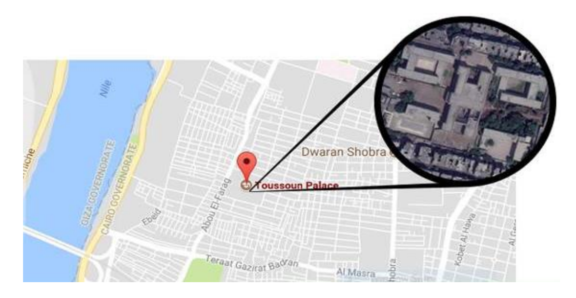
Fig. 2: Ariel view of Tosson palace [17]