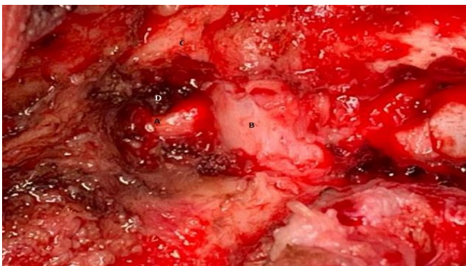
Fig. (2): Intra operative picture after complete decompression of C2 nerve and ganglion (A), showing the dura between C1 and C2 (B), posterior arch of C1(C), coagulated and dissected atlanto-epistropheic ligament (D).

The final result should be freeing the C2 nerve and ganglion from all compressive offending pathologies from the dural attachment medially till the nerve enters the muscles laterally (Figure 2).