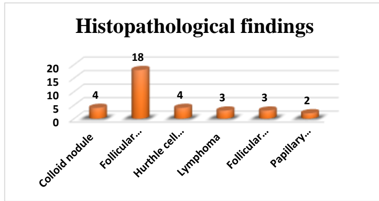
Fig. 2: The studied cases were distributed according to histopathological findings (n = 34)